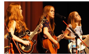
Red Roots on stage.